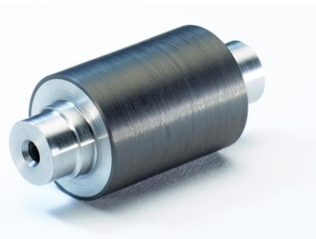
Fig. 3: High speed rotor with CFRP composite sleeve.

Composite sleeves can be assembled as tight fit solutions or can be applied by direct winding onto the rotors. One main advantage of direct filament winding onto rotor magnets is achieved by the elimination of machining the magnet outer surface of the rotor. Minor surface roughness of magnets and minor misalignment of magnets can be compensated by direct filament winding onto rotor magnets.