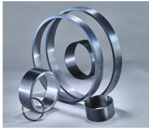
Fig. 2: Composite retention sleeves.

Composite retention sleeves (Fig. 2) offer the perfect technical solution as magnet retention sleeves due to their transparency for the magnetic field in combination with the high mechanical properties and low weight.